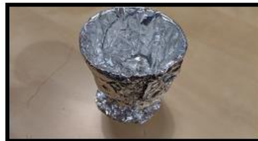
Wrap everything in aluminium foil.