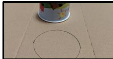
Trace around the top of a paper cup onto some thick card. Cut out the circle.