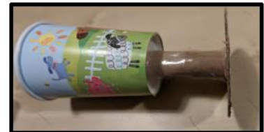
Tape or glue a small cardboard tube between the circle and paper cup.