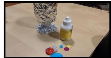
Decorate the cup with jewels or coloured